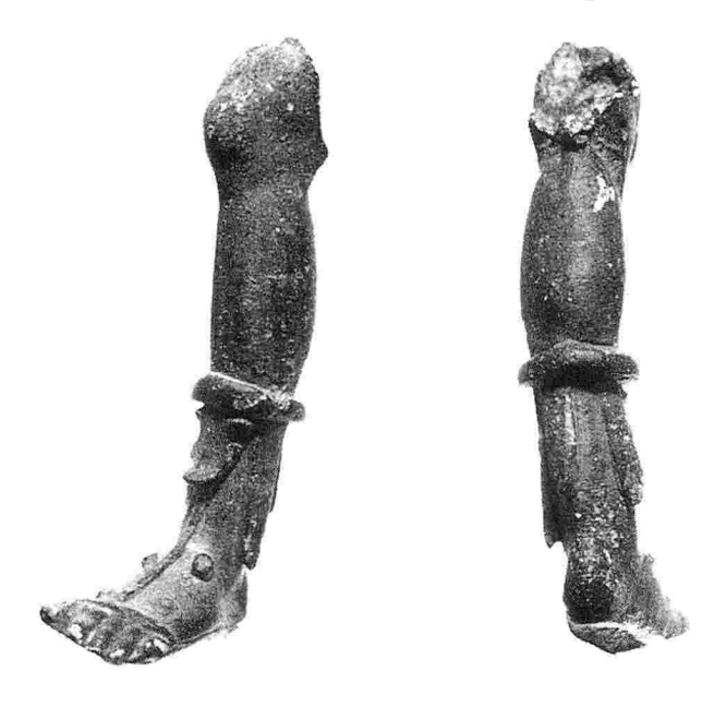
FIG. 89 - Preston St Mary: lar fragment, front and back

The well-modelled leg is bent at the knee, and broken just above this, the surviving length is 72mm. It is wearing an open-toed half boot, a type which first appears on sculptures in the 2nd century B.C. This boot was worn with leg bindings (pilio), part of which extended over the shaft of the boot and hung down over the leg. Hellenistic pilio are often shown as animal skins and indeed the Preston side hangings look like animal legs with paws and the front could be a stylised head (Dohan Morrow 1985, 141–49). On the foot there are two pairs of relief roundels flanking a central rib. The figure was originally mounted on a stand. It must have been a fair size for a Roman figurine, perhaps some 180mm. Up to the base of the knee, at the level of the break point at the back, the leg is a